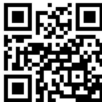
Many nursing schools require the TEAS Test. Scan QR Code above to get more information.