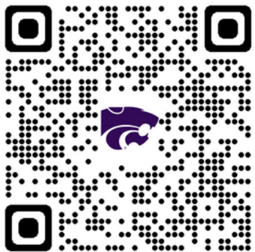
Scan QR Code above to visit K-State's Pre-Professional Advising Website

Students who complete PT school will receive a Doctor of Physical Therapy degree.