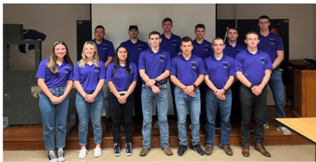
Program polos that allow Cadets to represent ROTC at outside events.

Thanks to donors, the Battalion was able to send Cadets to the Army 10-Miler in Washington D.C.