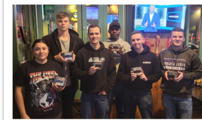
Cadets earn commissioning gifts afforded through generous donations.

Over the past year significant improvements have been made to the ROTC gym, also known as “The Pit,” starting in the summer of 2023. It started with the removal of dirt from the back half of the pit and the pouring of a concrete slab in the area. A new turf floor was then installed on the back half of the pit over the new concrete. Before the semester ended we received equipment donated from the Universities track and field team which consisted of two squat racks with powercat platforms, a lat pulldown machine, and a variety of new weights. The next step in the process is to install a new HVAC system, upgrade lighting and electrical, and more equipment for the pit.