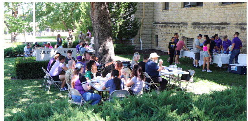
Freshman welcome week integrated new Cadets and their families into the program prior to classes starting.

Thanks to donors, the Battalion was able to send Cadets to the Army 10-Miler in Washington D.C.