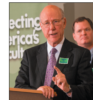
Gov. Kathleen Sebelius (left) and U.S. Sen. Pat Roberts (above) talk about the benefits of locating the NBAF in Kansas.