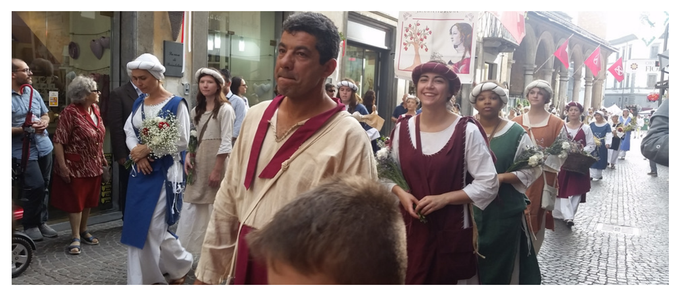
K-STATE ANTHROPOLOGY STUDENTS IN A PROCESSION IN ORVIETO