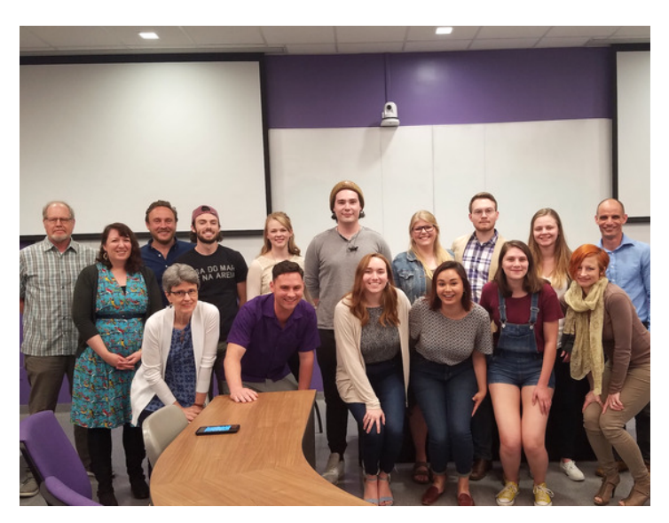
STUDENTS AND FACULTY AT SAPIENS SYMPOSIUM

Several undergraduates gave presentations about their work ranging from LGBTQ Christians to community impacts of wind farms.